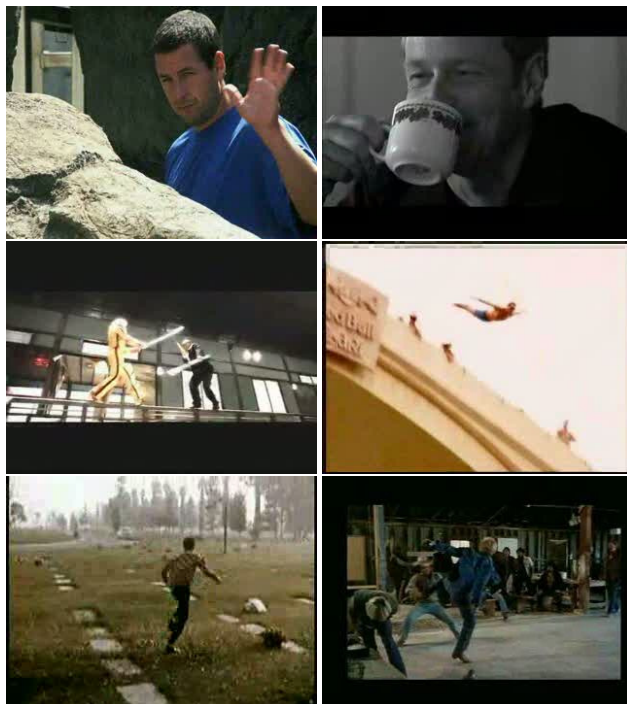
Figure 1. Sample frames from the proposed HMDB51 [1] (from top left to lower right, actions are: hand-waving, drinking, sword fighting, diving, running and kicking). Some of the key challenges are large variations in camera viewpoint and motion, the cluttered background, and changes in the position, scale, and appearances of the actors.

With several billion videos currently available on the internet and approximately 24 hours of video uploaded to YouTube every minute, there is an immediate need for robust algorithms that can help organize, summarize and retrieve this massive amount of data. While much effort has been devoted to the collection of realistic internet-scale static image databases [17, 23, 27, 4, 5], current action recognition datasets lag far behind. The most popular benchmark datasets, such as KTH [20], Weizmann [3] or the IXMAS dataset [25], contain around 6-11 actions each. A typical video clip in these datasets contains a single staged actor with no occlusion and very limited clutter. As they are also limited in terms of illumination and camera position variation, these databases are not quite representative of the richness and complexity of real-world action videos.